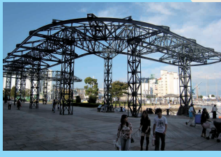
清水港テルファー Telpher of the Shimizu Port In Japan, only three Telpher unloading cranes were built in 1928. The last one remaining is preserved in here, as a registered cultural property.